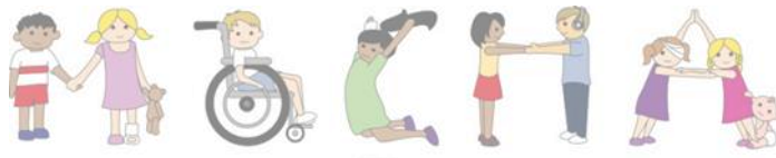
Models of Child Health Appraised (A Study of Primary Healthcare in 30 European countries)